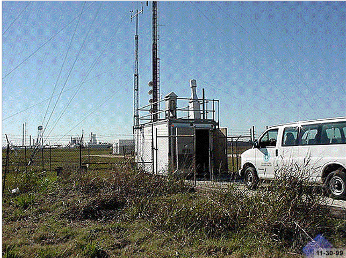
Overall Site View of HRM 07 Monitor Location