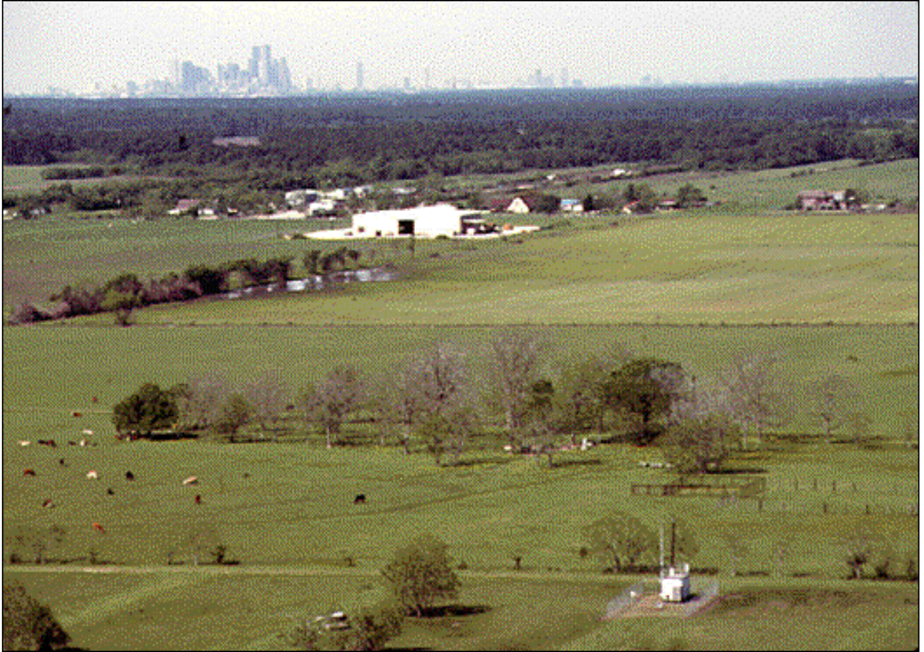
Overall Site View of HRM 04 Monitor Location